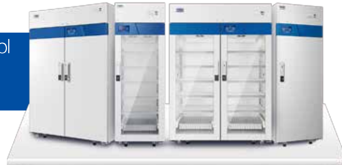
HYC-1099TF HYC-509T HYC-1099T HYC-509TF

Liquid crystal touch screen control Intelligent IoT