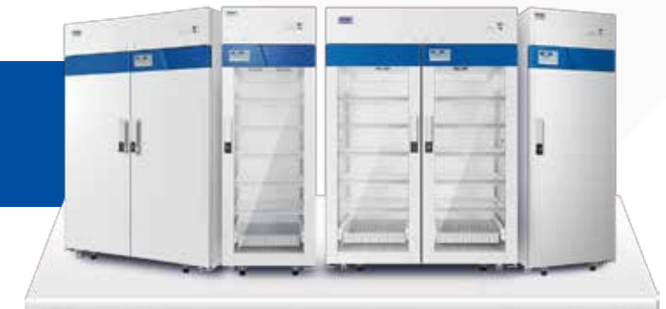
HYC-1099F HYC-509 HYC-1099 HYC-509F